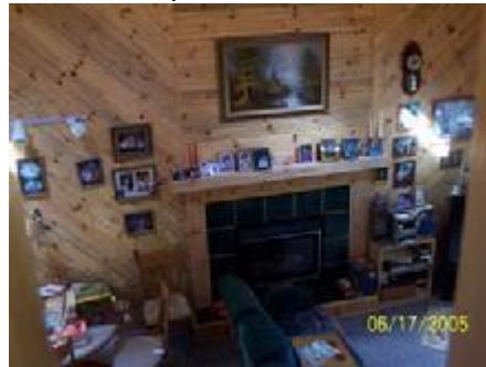
Fireplace from Loft